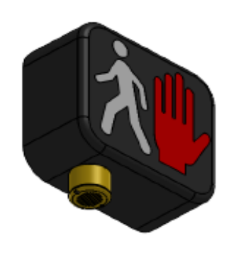
Figure 3. BBU mounted to Ped Head