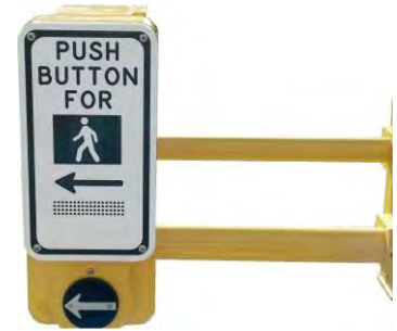
90 degree adapter