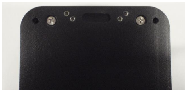
Base Station Rear View