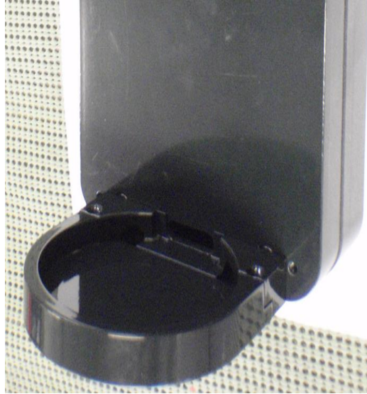
Pole Top Cap attached to Bracket