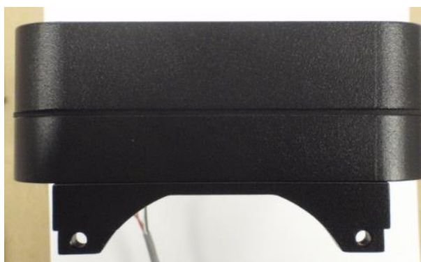
Base Station Top/ Down View