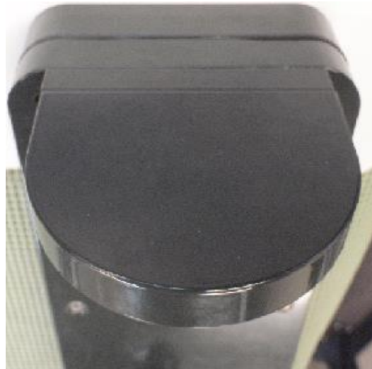
Completed View Top / Down