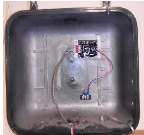
Figure 2. SPI Installed